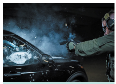
Proprietary Ballistic Advantage ™ Strike Surface, our unique technology rapidly expands bullets on impact, dramatically reducing penetration and dispersing energy more effectively than ever before!